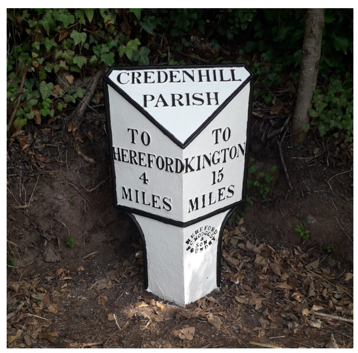
Fully restored mile post

I think you will agree that Jeremy has done a fantastic job!