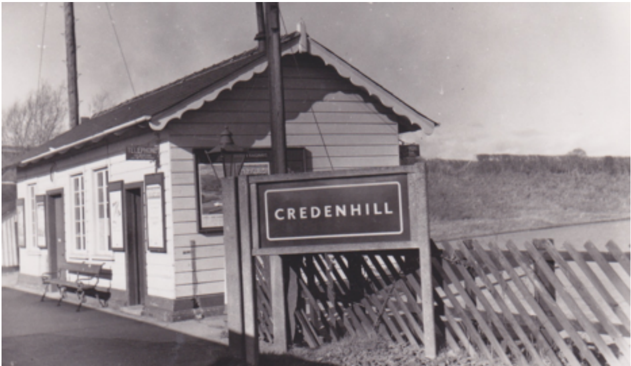
Photo taken from train [note smoke from loco in sky] 18.2.1961. Also Telephone signs both sides of building with additional wording "telegrams may be telephoned".