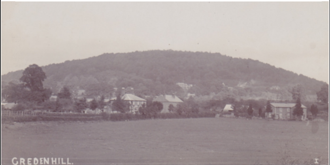
Early view of Credenhill 1902